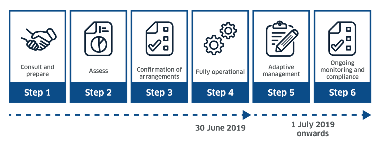
Figure 4: The process for developing, assessing and implementing prerequisite policy measures.

New South Wales, Victorian and South Australian state governments have been working to ensure pre-requisite policy measures would be in effect as of 30 June 2019. This work has included conducting consultation through workshops and focused consultation with environmental water holders, river operators and other entitlement holders. In March–June 2019, the MDBA assessed whether these measures are in effect/enabled in water management frameworks. This assessment was then reviewed by the Independent River Operations Group.